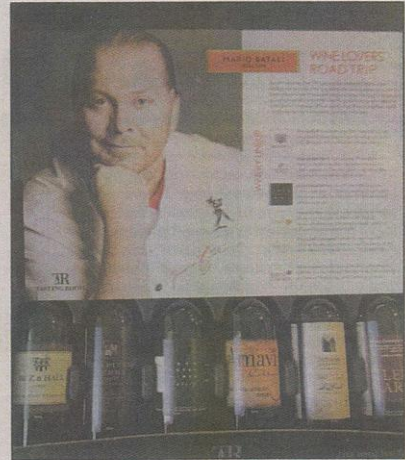
Samples from the Tasting Room

Each little bottle is fully labeled. The neat, black boxes they come in make for great gift giving. But