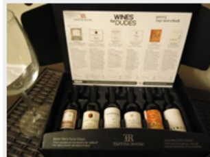
"Wine for Dudes" Sampler from TastingRoom.com