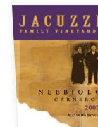
Jacuzzi '07 "Nebbiolo" Carneros