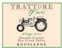
Trattore Wines '09 Roussanne Dry Creek Valley