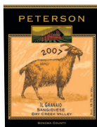
Peterson '07 "Il Granaio" Sangiovese Dry Creek Valley