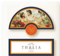
Viansa '05 "Thalia" Sangiovese Sonoma County